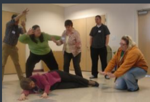
Workshop participants grouped up to create a planned Tableau to communicate the text a poem.